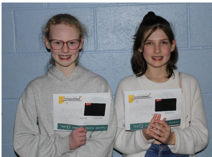
Reward Coin Winners

Congratulations to all the award winners for their hard work, dedication, and noteworthy achievements. The Hyndburn Academy looks forward to continued success and excellence in the upcoming terms, as students and staff alike remain committed to fostering a culture of learning and achievement.