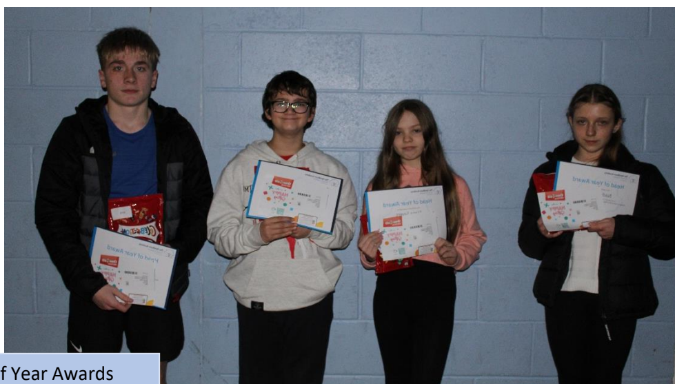
Head of Year Awards